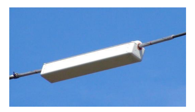
Picture 1: "Power flow controller" - Distributed Series Reactor (DSR)